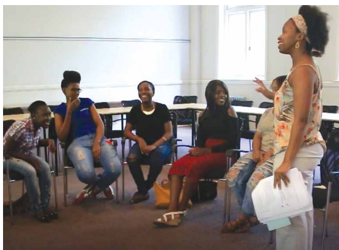
Still from a video about the study: EMPOWER club

Wits RHI, as a STRIVE partner and a participant in several PrEP trials, has leveraged its unique position and knowledge of both structural and biomedical HIV prevention interventions to influence and shape the national combination prevention programme for girls and young women in South Africa ('She Conquers'), which includes increasing access to PrEP.